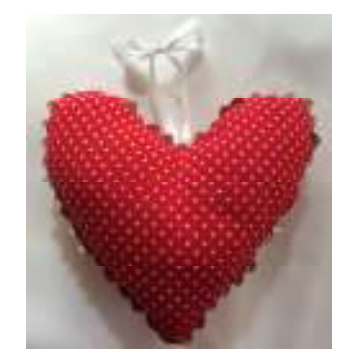
© 2014 Lyn Brown www.LynBrown.com 2/14/14