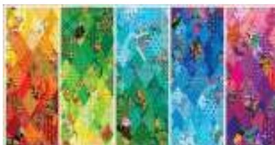
Banners from Sochi Winter Olympics 2014