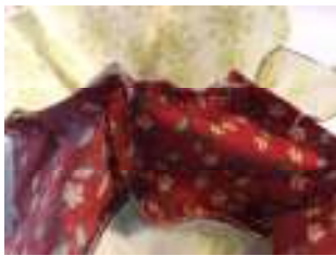
Stitch Cups together, peak to valley, to form ball. Leave opening, turn and stuff.