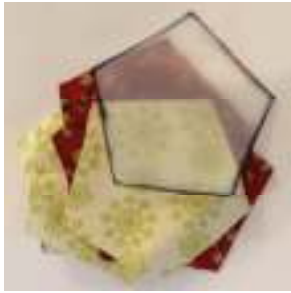
Cut 12 Pentagons using template given