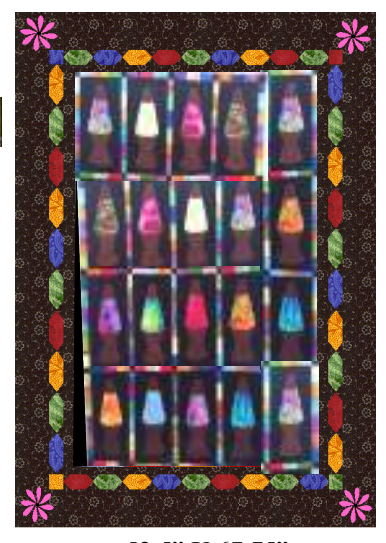
52.5" X 67.75"