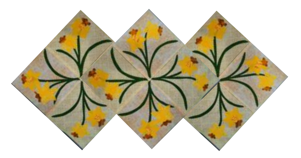
"Daffy" TableRunner Applique Pattern (One Quarter Given) 17" X 34"

Make one full by tracing four blocks (rotated). Also make 6 single Blocks.