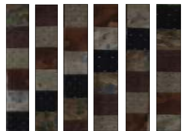
Unsew Loops To Form Strips