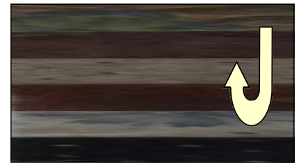
Sew Strips Together