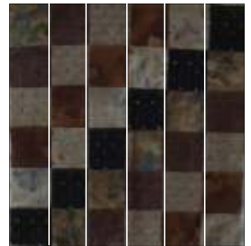
Stitch Strips Into Block