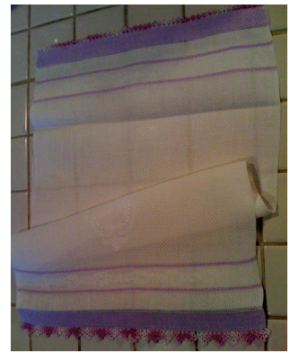
Antique Tea Towel