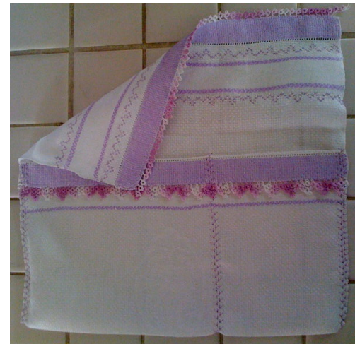
Steps 3, 4 and 5