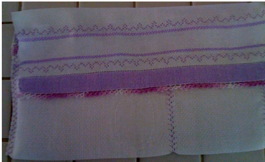
Completed Tea Towel Pouch