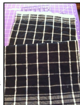
Quilt the Layers