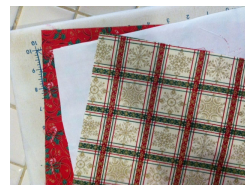
Fuse two squares together

1. Fuse the webbing to the reverse of one square, remove the paper and fuse to the second square forming a sandwich. Press well, especially along the edges.