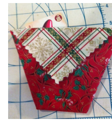
Press Points Down