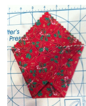
Press In Corners, Tack If Desired

6. As shown in Sack at lower right, you can tack the Step 4 points and a ribbon handle in place with a button when the sack is complete.