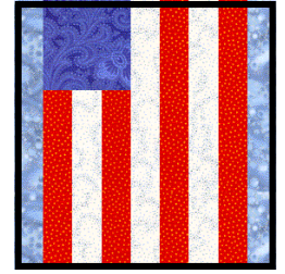
Type A Block Make 1