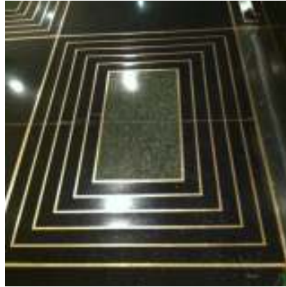
Inspired By NYC's Rockefeller Center