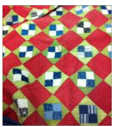
The Original Quilt was quilted by hand in an all over Fan pattern

1/8 yard Dark Blue 1/8 yard White 1/4 yard Acid Green (Starch before cutting to help with bias) 1/2 yard Red (Includes Binding) (Starch before cutting) 20" x 26" Batting and Backing